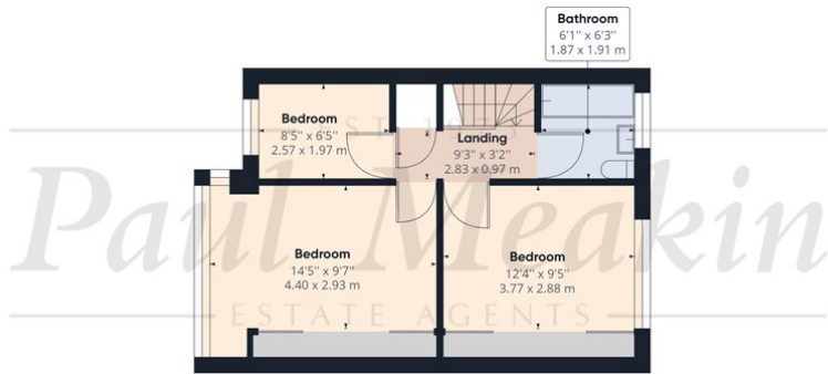
Floor 1 Building 1